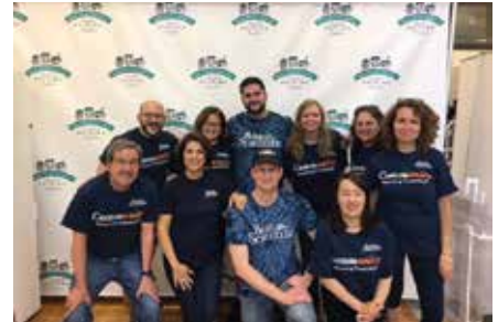
Boston Scientific employees helped sort food and facilitate food pantry appointments.