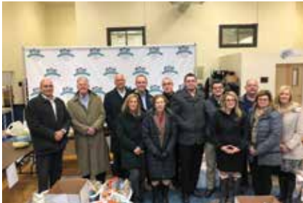
Middlesex Saving Bank employees helped to deliver Thanksgiving meals.

NSC's volunteers are the lifeblood of our organization. Without the help of our volunteers, we could not provide the array of services we do to our families. From businesses and church groups to schools and community groups, we partner with many different organizations to help carry out our mission and help our neighbors.