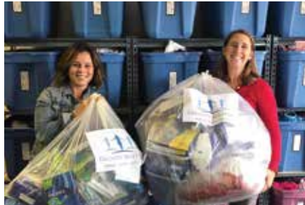
NSC partners with Dignity Matters to help distribute feminine care products and undergarments to girls and women to help them stay healthy, self-confident and live with basic dignity.